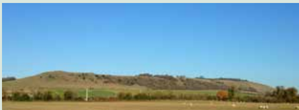
Giant's Grave left, with Martinsell at the far right of the plateau.