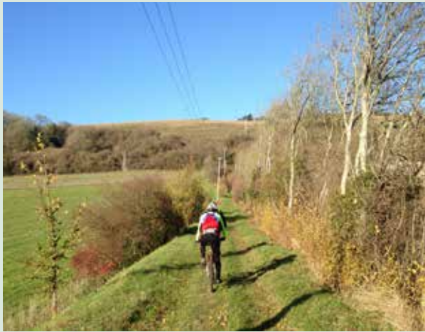
The bridleway to Martinsell from West Wick Farm