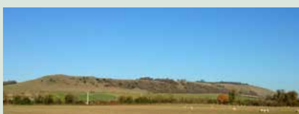
Giant's Grave left, with Martinsell at the far right of the plateau.