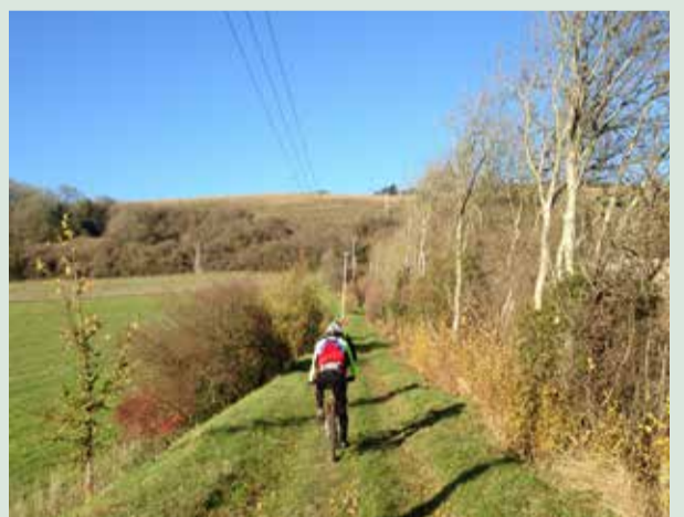
The bridleway to Martinsell from West Wick Farm